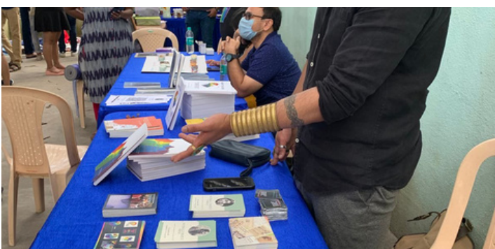
QAMRA at the Namma Pride garage sale

The archive in collaboration with the India Foundation for the Arts (IFA) invited applications for an IFA-QAMRA Creative Project and an IFA-QAMRA Scholarly Project, under its Archives and Museums programme, which IFA will implement. The Archives and Museums programme of IFA was initiated with a two-fold objective: to provide arts practitioners and researchers with an opportunity to generate new, critical and creative approaches for public engagement with archives and museum collections, and to energise these spaces as platforms for dialogue and discourse. One applicant each for scholarly and artistic projects will be selected after shortlisting and interviews. IFA will provide them each with a grant of Rs. 2 lakhs disbursed over a year for the realisation of their projects.