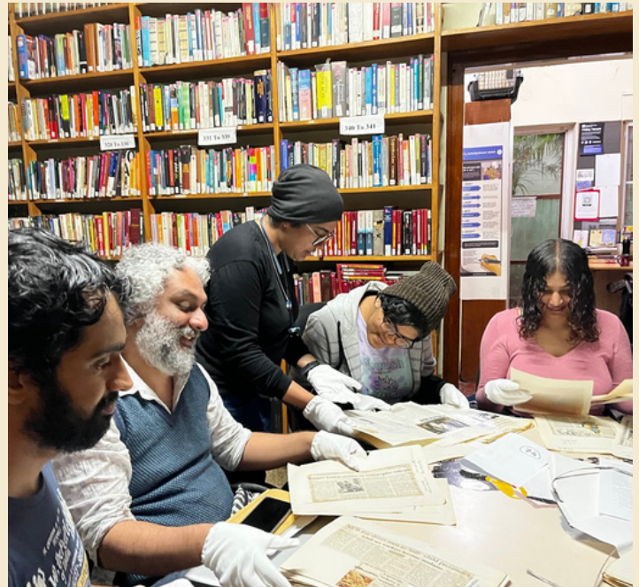
Different groups sorting through material at the Archival Workshop held at ALF

Responding to the general interest in queer history and archiving it, we conducted a 3-hour archiving workshop at the Alternative Law Forum. The objective of the workshop was to familiarise the participants with the archive and our approach to working with queer collections.