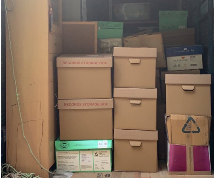
Collections at the archive